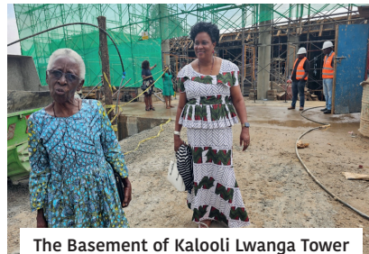
The Basement of Kalooli Lwanga Tower