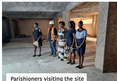
Parishioners visiting the site

The construction of the Tower is in progress and this has been made possible by a loan of 9bn that was solicited from Centenary Bank. Currently, we are paying interest on the principal used monthly. The interest keeps on increasing as we use the bank loan. Please note that the Tower is still under construction and no occupants. See pictures below;